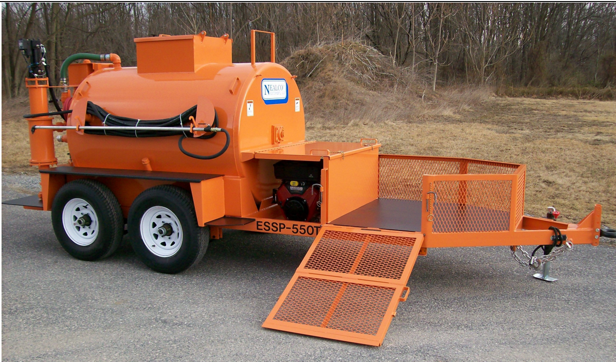
NEALCO MODEL ESSP550 TRAILER (EXTENDED DECK)